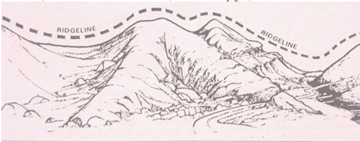
Figure 10-16. Ridgeline.