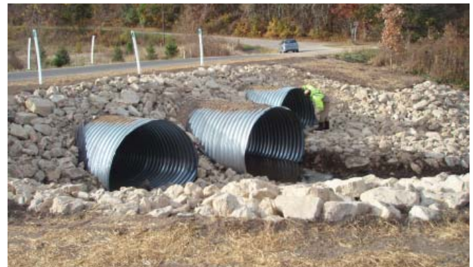
Craig Hardy, Iowa County Highway Commissioner, performing final inspections on the bridges on Sneed Creek Road above, and Weaver Road below.

Since the length of the culverts is 56 feet and the Average Daily Traffic count is less than 250 vehicles per day, guard rails are not needed or required, and neither are the familiar yellow and black tiger stripe markers.